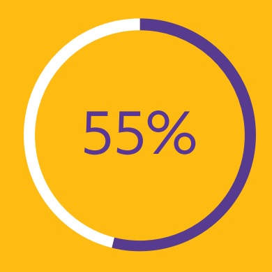
achieved 3 or more GCSE qualifications