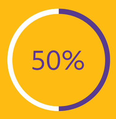
of pupils accessing the full curriculum achieved a Level 1 threshold (5 GCSE's or more).