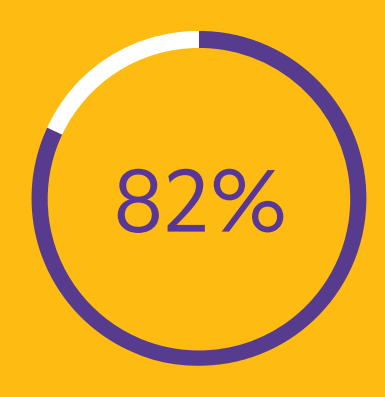
of our learners had positive destinations and were still engaged in the provisions in the Autumn term.