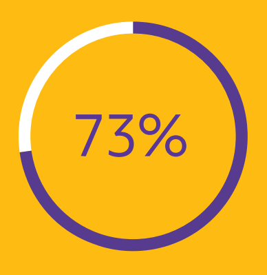
of pupils achieved at least 1 GCSE qualification

During the 2022-23 academic year, 20 Year 11's completed their education at ACT Schools. The outcomes of those who completed the year can be summarised as follows: